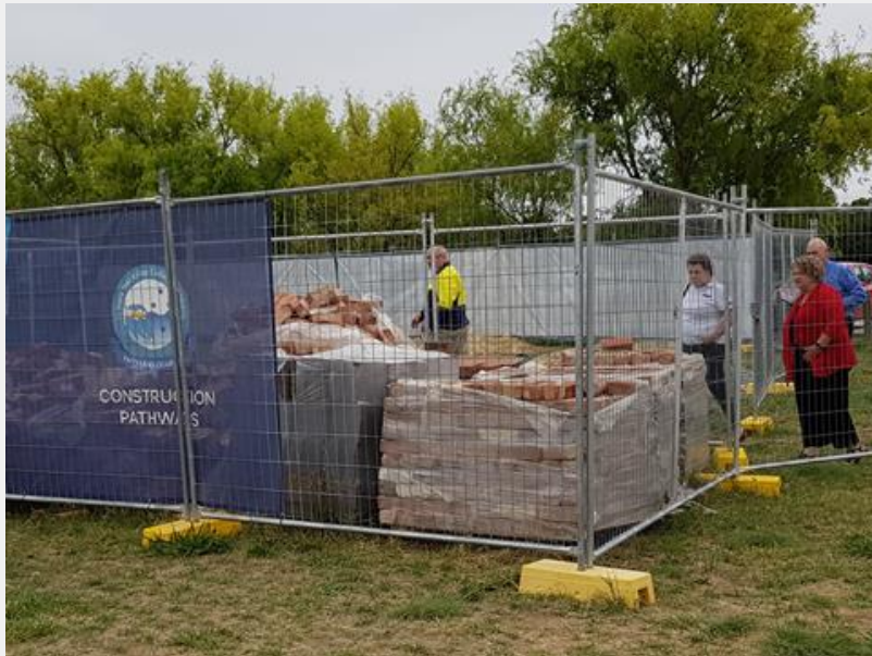
The outside compound for Concreting and Bricklaying activities